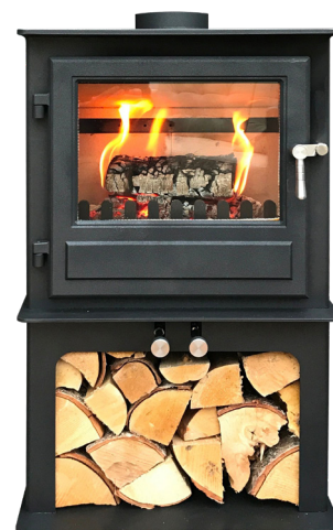
Black & Stainless Steel Log Box Option