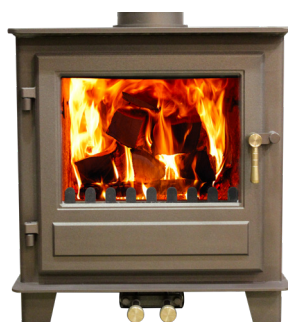
Honey Glow & Brass Option